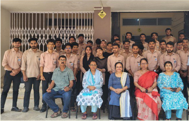
The Class of 2021-2024