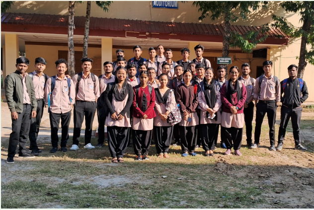
The Class of 2023-2026