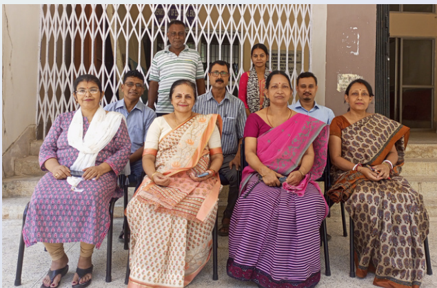
(LEFT TO RIGHT)